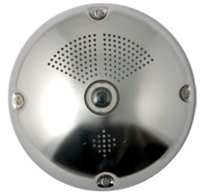
Q24 Standard, diam. 160 mm Q24 Vandalism, diam. 160 mm

Q24M-360° in use: compact, mobile, easy installation, professional image post-processing