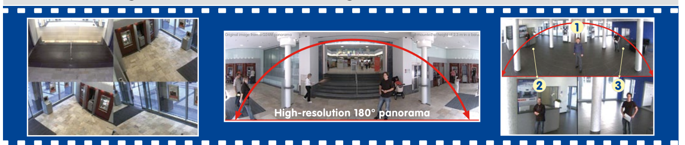
3 simultaneous views