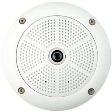
Q24 Standard, diam. 160 mm